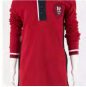
PCSST UNISEX POLO LONG SL. BURG.