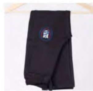
PCSST UNISEX SWEATPANTS (NAVY)