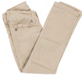
PCSST Unisex Khaki Pants