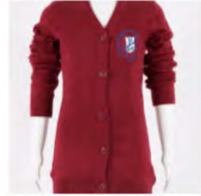
PCSST GIRL CARDIGAN (BURGANDY)