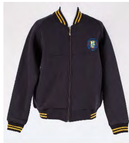
PCSST Fleece Jacket