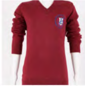
PCSST UNISEX V-NECK SWEATER BURG.