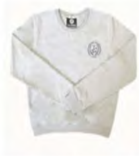
PCSST SWEATER (GRAY)