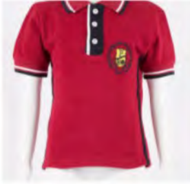
PCSST UNISEX POLO SHORT SL. BURG.