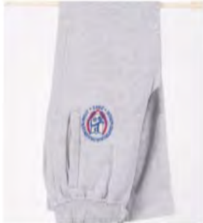
PCSST ADULT SWEATPANTS (GRAY)