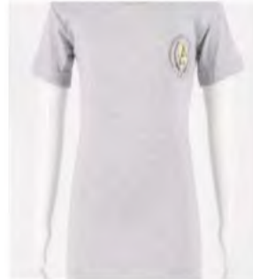
PCSST UNISEX SPORT T- SHIRT (GRAY)